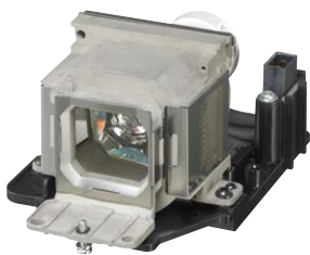
LMP-E212 Projector Lamp (for replacement)