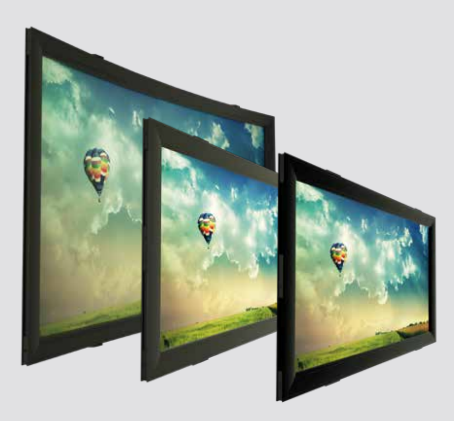
Curved Classic Velvet