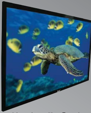
(shown here with ezFrame)