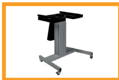
Horizontal 'table mode'