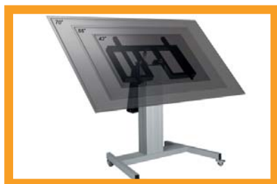
Various display sizes