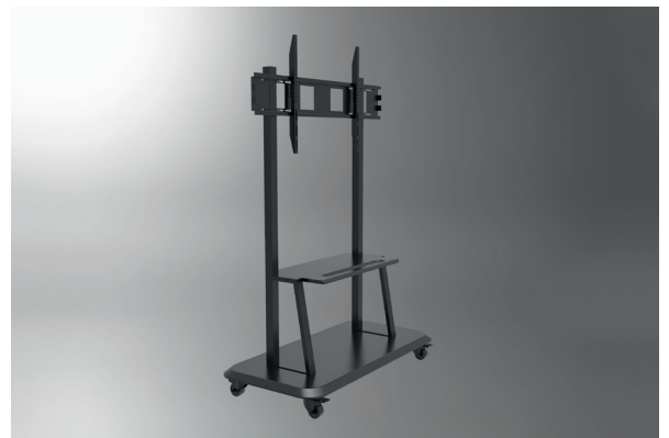
celexon Professional Adjust-55120MP

These trolleys offer enormous convenience of use thanks to an integrated shelf and wide base plate that serves as additional mobile storage space.