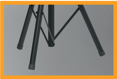
Three-foot tripod with foot caps