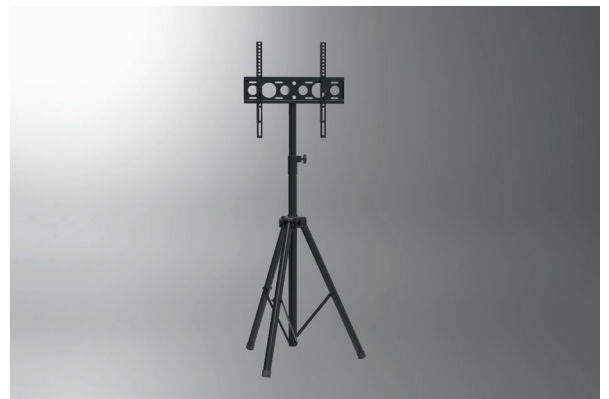
celexon Economy Adjust-4055T