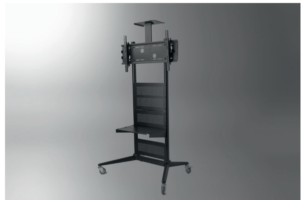
celexon Economy Adjust-3270M