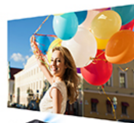
SuperColor™ projectors offer color accuracy levels

ViewSonic's exclusive SuperColor™ Technology delivers superior colour range than competitor projectors, ensuring that users enjoy more realistic and accurate colours. With an exclusive colour wheel design and dynamic lamp control capabilities, SuperColor™ Technology projects images with true-to-life colour performance in all scenarios, also reducing eye fatigue in bright and dark images.