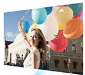
Conventional projectors offer low-quality images