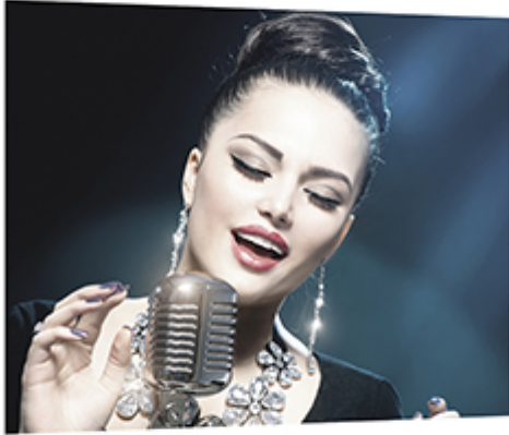
ViewMatc® Color Mode