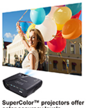
color accuracy levels

ViewSonic's exclusive SuperColor™ Technology delivers superior colour range than competitor projectors, ensuring that users enjoy more realistic and accurate colours. With an exclusive colour wheel design and dynamic lamp control capabilities, SuperColor™ Technology projects images with true-to-life colour performance in all scenarios, also reducing eye fatigue in bright and dark images.