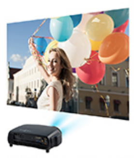
Conventional projectors offer low-quality images