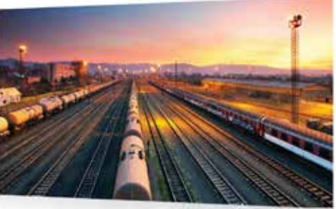
View the best possible images